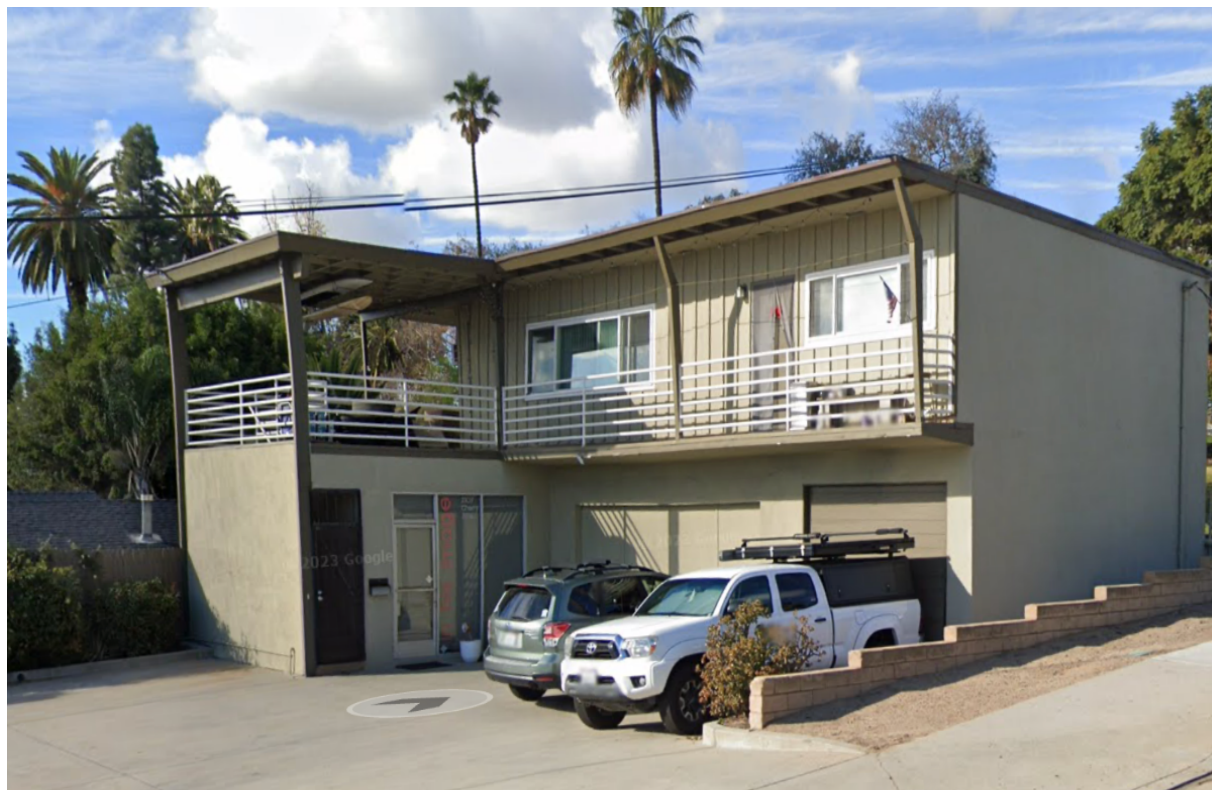
Figure 3: Street View of Subject Property