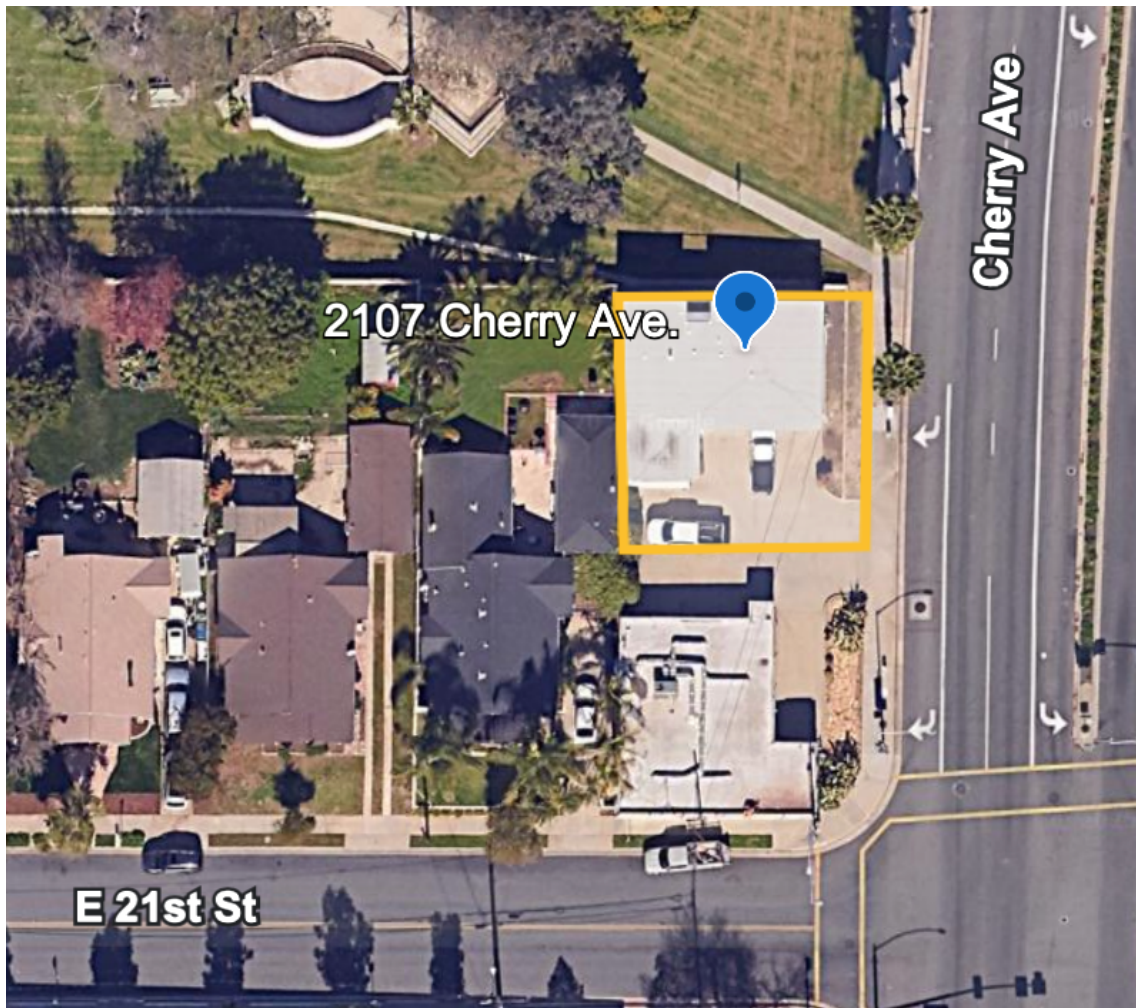
Figure 2: Project Site Location

The site contains a two-story structure totaling approximately 2,080 square feet, with 1,040 square feet of ground-floor commercial space and two one-bedroom residential units occupying the upper floor. All units are currently occupied and in active use.