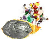
SNACK BAGS & CANDY WRAPPERS