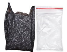
PLASTIC BAGS OR FILM*