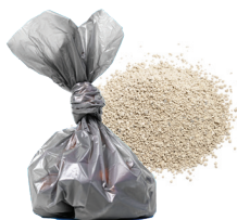
PET WASTE & KITTY LITTER

* PLASTIC BAG OR FILM RECYCLING: PLEASE VISIT PLASTICFILMRECYCLING.ORG FOR PLASTIC BAG AND FILM RECYCLING SOLUTIONS AND POSSIBLE DROP-OFF LOCATIONS NEAR YOU.