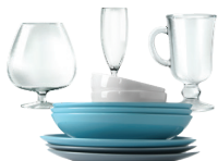
BROKEN GLASSWARE & DISHES