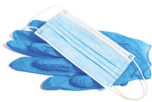
DISPOSABLE GLOVES & MASKS